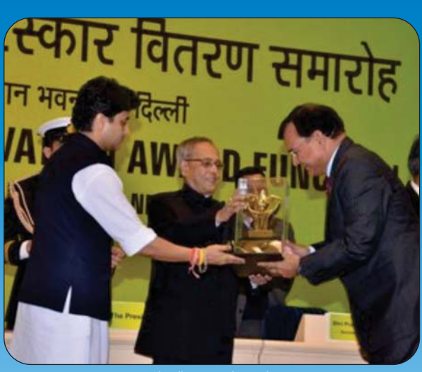
CMD BSNL receiving the "National Level Energy Conservation Award" from Hon'ble President of India